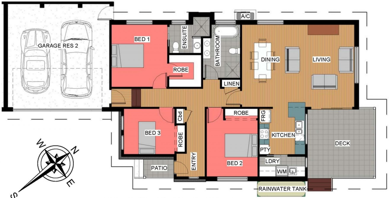
RESIDENCE 2 - FLOOR PLAN NOT TO SCALE